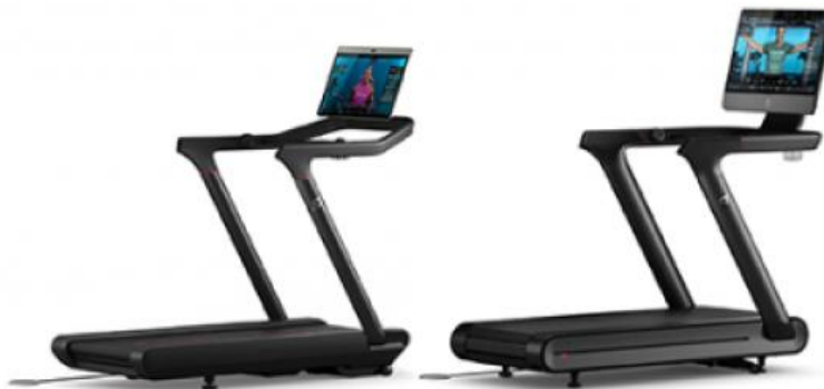
Recalled Peloton Tread and Peloton Tread Plus Treadmills