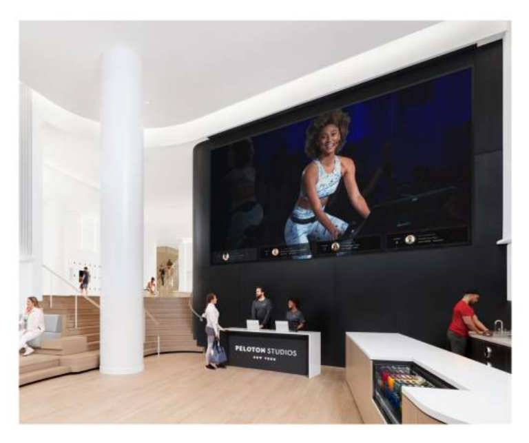
The All-New Peloton Studios New York